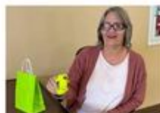
3 rd Place