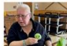
4 th Place